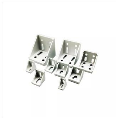
slot8 slot10 aluminium profile 90 d...