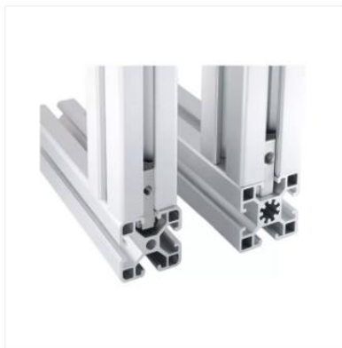
Fastener Nickel plated Inner L shap...