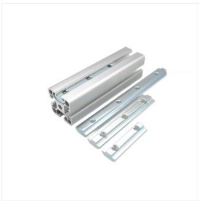
Slot connector for 3030 4040 4545 ...