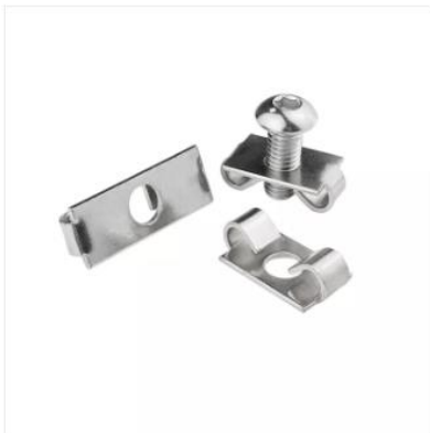
Custom 3030 4040 aluminum Extru...