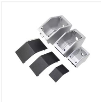
135 Degree Aluminum profile conn...