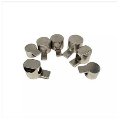
Whistle Hidden Inner Bracket Conn...