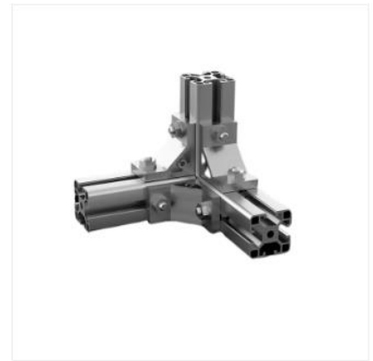
Corner joint cnc aluminium profile ...