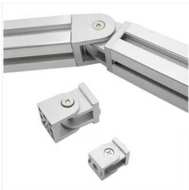
Aluminum Profile Pivot joint with I...