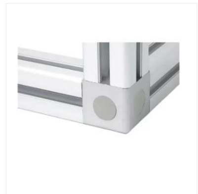
cubic corner connector 2-Way 3-w...