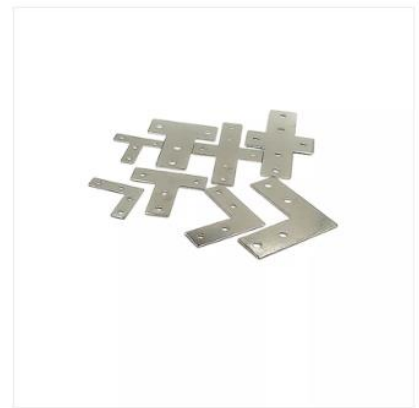
cross connector aluminum profile ...