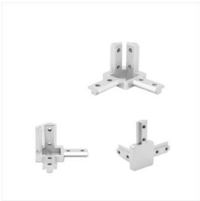
3 Way Aluminium Profile 2020 Ang...