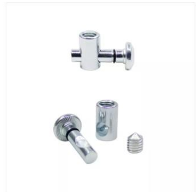
Carbon Steel Central Connector for...